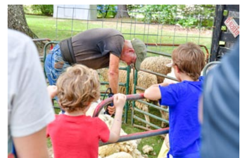
Sheep Shearing demo

During the World Gee Haw Whimmy Diddle competition, contestants are judged on the number of rotations between gees and haw they can complete during a given time. They may be asked to switch hands or whimmy diddle behind their back. All ages may compete with trophies given for best child, adult, and professional. Winners receive a moon pie and bragging rights.