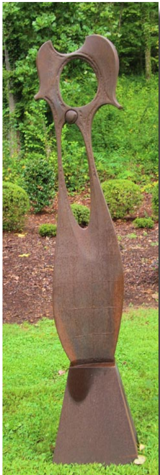
(left) Luna 2023 Best of Show by Sam Spiczka of Apex, NC

Sculptor registration is open through September 4th. Visit www.caldwellarts.com for complete details and the prospectus.