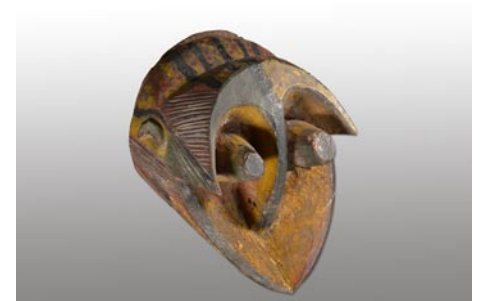
Work from Charles Jones African Art

Bottega Art & Wine Gallery , 723 N. 4th Street, Wilmington. Ongoing - Featuring works by regional and international artists in a variety of media. Hours: Tue.-Wed., 1-10pm and Thur.-Sat., 1pm-midnight. Contact: 910/399-4872 or at (www.bottegagegallery.com).