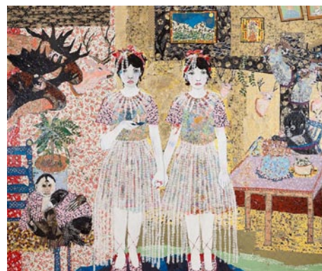
María Berrío, "Aminata Linnaea", 2013. Mixed media on canvas, 80 x 96 in. Weatherspoon Art Museum, UNC Greensboro. Purchase with funds from the Weatherspoon Art Museum Acquisition Endowment for the Dillard Collection; 2017.16. © María Berrío

Brookgreen, home to the largest and most significant collection of American figurative sculpture in the world, will be the premiere location of this exceptional annual exhibition. The National Sculpture Society (NSS) is the country's first organization of professional sculptors and handpicks pieces for this exhibition, presenting the finest in contemporary figurative sculpture by American masters alongside rising stars. The 41 works in this annual awards exhibition are selected by a jury from hundreds of entries. The exhibition includes bronze, clay, iron, and mixed media sculptures of wildlife, natural elements, abstract figures, and more. For further information call the Gardens at 843-235-6000 or visit ( www.brookgreen.org ).