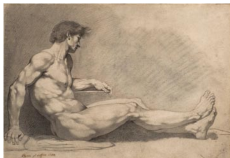
Jean-François-Pierre Peyron, French, 1744-1814, "Académie: Seated Male Nude", 1780, black chalk on off-white laid paper, 14 3/8 x 20 7/8 in., (36 x 53 cm). The Horvitz Collection, Wilmington.

relationship between life and death." For further information call the League at 843/681-5060 or e-mail to ( admin@artleaguehi.org ).