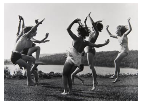
Barbara Morgan, "Children Dancing by Lake", Camp Treetops, 1940, gelatin-silver print, 13 3/8 x 18 in., North Carolina Museum of Art, Gift of Richard and Lois Zakia