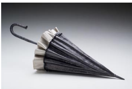
Elizabeth Brim, "Petite Parasol", 2009, forged and fabricated steel and stainless steel mesh, 30 x 10 in., Collection of Noelle and Mark Mahoney, © 2009 Elizabeth Brim

Elizabeth Brim, a prominent blacksmith, uses metalwork - traditionally considered a "man's medium" - to make a sly commentary on the gendering of materials. Her forged steel pieces represent soft and stereotypically feminine objects: frilly pillows, high-heeled shoes, tutus, and aprons. Together, these artists jovially chisel away at the assumptions plaguing their chosen materials, forging new thoughts about objects and those who