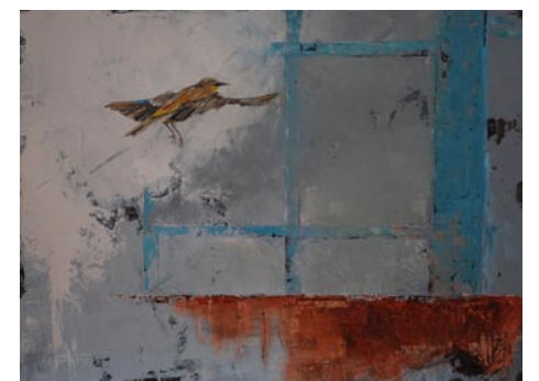
Work by Marlise Newman

The notion of seeing is implied in the term 'window' itself, with notions of opening, showing, and light. The ordinary windows in our houses demarcate a boundary between inside and outside, between what's private and what's public. There are numerous ambiguities presented by the windows view, not the least of which is the viewer as voyeur. The window becomes a frame for its variable content, a marker of difference between what is inside and outside. Looking through the window from either side crosses a