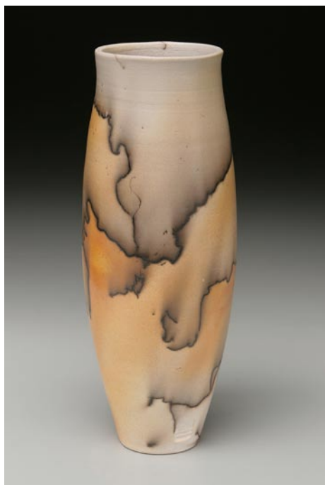
Work from Black Mountain Studios