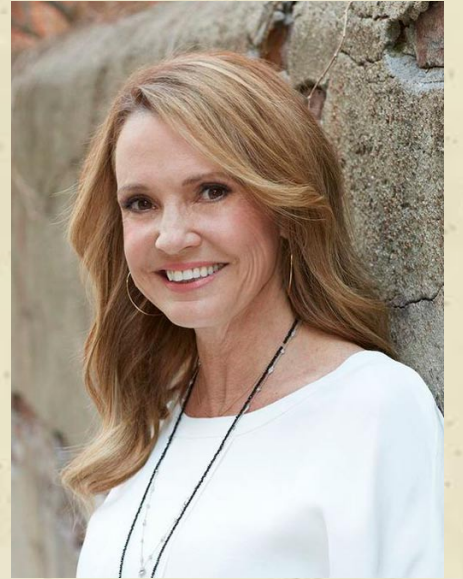
Patti Callahan Henry

Next Henry brings us to today's Low Country as she details one of her favorite book settings. Henry will talk about her book, And Then I found You , set in our very own Bluffton, and her newest book, The Stories We Tell , set in neighboring Savannah. As Patti Callahan Henry shares details about her background and writing, past books, current ones and sneak previews for what's next, we glimpse the exciting world of fiction through a very talented author's writings.