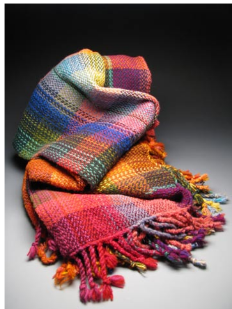
Work by Edwina Bringle

NC Institutional Gallery listings or call 828/959-2828.