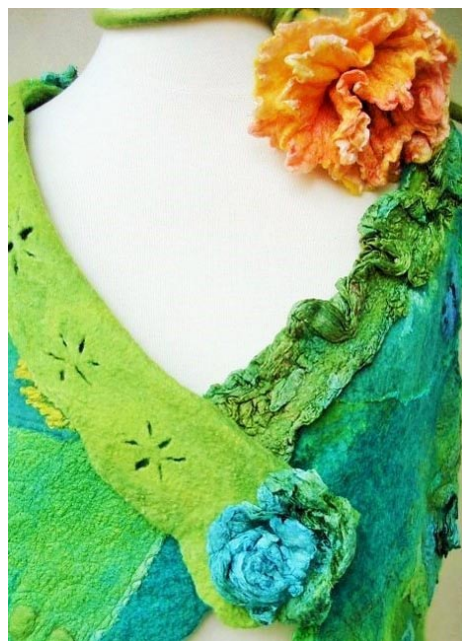
Work by Molly Duke, detail

Beaufort Town Center shopping plaza on Boundary Street in Beaufort. Show and sale hours will be Friday, Oct. 3, from 11am to 8pm; Saturday, Oct. 4, from 10am to 5pm; and Sunday, Oct. 5, from noon to 4pm.