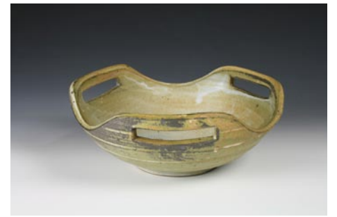
Work by Joe Singewald

“I am deeply satisfied when my ceramic interpretations create an aesthetic attraction upon entering individuals' private lives. I choose to hand build and wheel build utilitarian pottery with hopes my cups are the first to dirty once un-