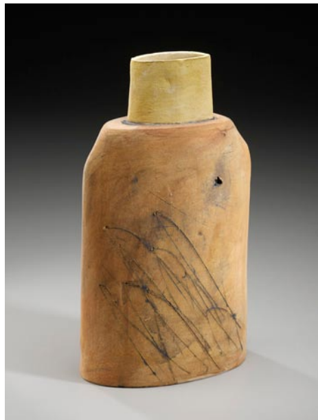
Work by Rob Pullyen

Rob Pullyen offered the following about his work, “I am in love with the basic material of ceramics: wet clay. I have, for some wonderful reason, become comfortable with the language of clay so that working with it is exhilarating, frightening, mysterious...and totally satisfying.”