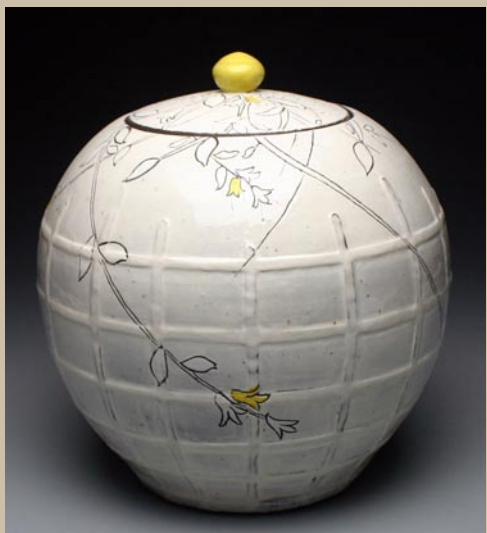
Work by Ben Carter

If you like what you hear you might want to sign up for the newsletter. To join the list click the following link and sign up in the box below the streaming player: ( http://www.carterpottery.blogspot.com/2009/05/welcome-to-tales-of-red-clay-rambler.html ).