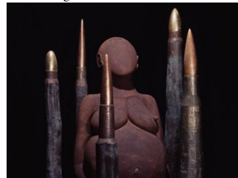
Works by Herb Parker

For further information check our SC Institutional Gallery listings, call the Institute at 843/953-4422 or visit ( www.halsey.cofc.edu ).