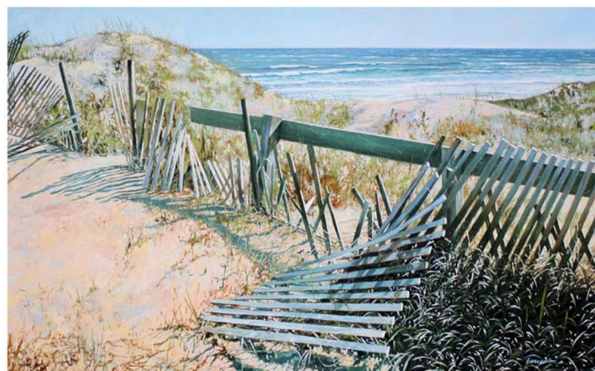
GARY GOWANS, PICK UP STICKS , 26x38