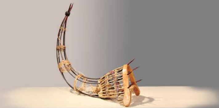
AND OTHER MEDITATIONS BY HERB GOODMAN

The USC Upstate Visual Arts Program includes Bachelor of Arts programs in: