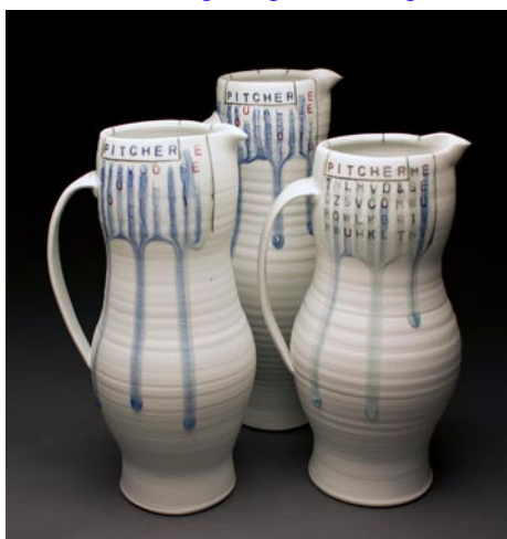
Works by Andrew Coombs

The Gala Preview Opening, an evening of wine, music and food, is a ticketed event ($15 members or $20) that begins on Sept. 13, at 6:30pm in the gallery area of The ARTS Center. You may purchase tickets to the Friday night Gala event by contacting The ARTS Center at 864/633-5051 or visit ( http://explorearts.org/ ).