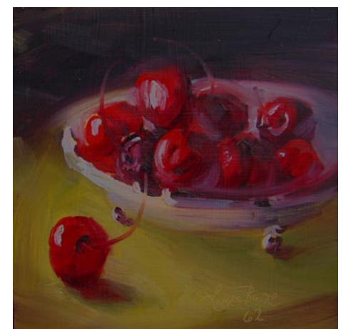
Work by Laura Buxo

For further information check our SC Institutional Gallery listings, call the Center at 864/633-5051 visit ( http://explorearts.org/ ) or ( https://www.facebook.com/ClemsonArtsCenter ).