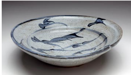
Shoji Hamada, Untitled Bowl, ca.1952, Stoneware with glaze, Black Mountain College Museum + Arts Center Collection

The project will also include a comprehensive schedule of educational programming designed to broaden the public's understanding and engagement with Black Mountain College's legacy and the role of craft and design in America. The schedule will include: (1) a lecture by Ellen Lupton on Oct. 24, 2013, hosted at BMCM+AC and co-sponsored by the Western Carolina University (WCU) Design Development Foundation (DDF) as a part of the "Ideas