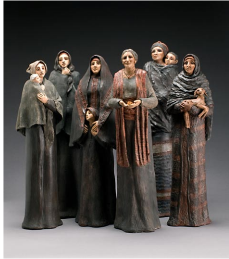
Works by Becky Gray

The figurative sculptures of ceramic sculptor Becky Gray provide a quiet place where one may reflect upon the narrative possibilities of the human condition. "The dichotomy within man mimics that of nature - full of beauty on one hand and destruction on the other," notes Gray. "In my work, however, I endeavor to convey the inherent goodness within mankind, whether quietly masked or direct."