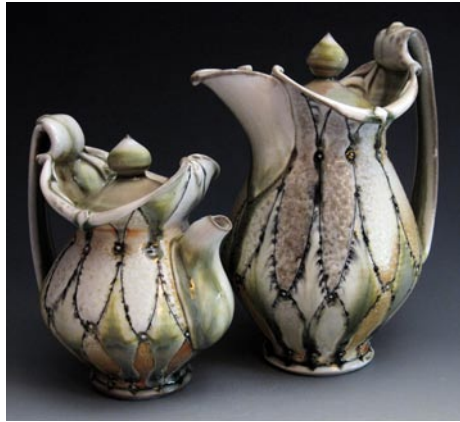
Works by Lorna Meaden

Gray's works are hand built; she uses thrown forms, extrusions, coils and slabs combined in different ways to create pieces that are sculptural and often ceremonial in nature. Her works are raku-fired with light reduction, generally sprayed with water and