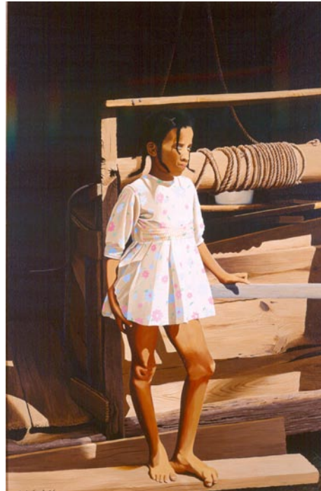
WANDA, by Bob Timberlake, 1973, Tempera

For further information check our NC Institutional Gallery listings, call the Museum at 828/295-9099 or visit ( www.blowingrockmuseum.org ).