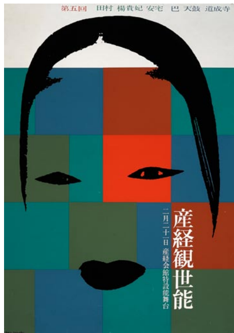
Ikkō Tanaka, Japanese, 1930–2002: The 5th Sankei Kanze Noh, 1958, color screen print; Merrill C. Berman Collection, © Estate of Ikkō Tanaka.

Although Japanese posters have been included as elements in larger design exhibitions in the United States, they have only occasionally been the focus of attention in their own right. Seen together, posters from these decades illustrate the substantial cultural and economic transformations that took place in Japan – from the country's ascension as an economic world power to the radical shifts occurring in performing arts, including the rise of Japanese avant-garde theatre.