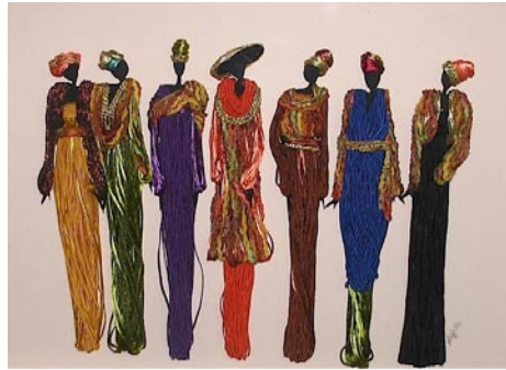
Work by Addell Saunders

The Charleston County Public Library in Charleston, SC, will present the exhibit Images of South America: Sailing With Art - An Inter-American Artistic Dialogue Exhibit , on view in the library's lobby, from Sept. 6 through Oct. 6, 2012. A reception will be held on Sept. 6, from 6-8pm.