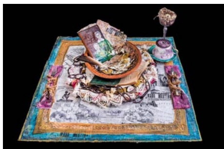
Work by Heidi Darr-Hope, honoring the Grimke Sisters

The Supper Table pays tribute to a baker's dozen of women whose contributions to American culture have rarely been celebrated. Nearly 60 South Carolina contemporary women artists from literature, filmmaking, theatre and visual art contributed to the creation of The Supper Table which is an homage to Judy Chicago's iconic 1979 art installation The Dinner Party . The centerpiece of the exhibition is a table set with an interpretive place-setting that honors each of the women, giving them a "seat at the table."