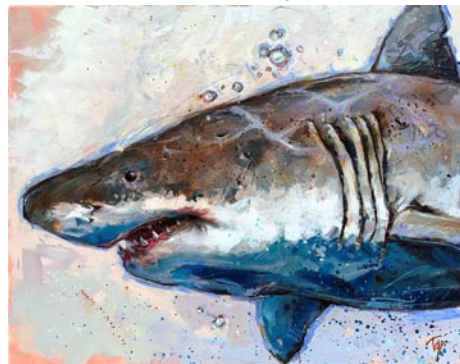
Work by Trip Park

The Sportsman's Gallery, 165 King Street, Charleston. Ongoing - Featuring one of the largest, most diverse collections of contemporary sporting and wildlife art found today and once having viewed it, we are confident you will concur. Hours: Mon.-Fri., 10:30am-5:30pm, Sat., 11am-5pm or by appt. Contact: 843/727-1224 or at ( www.sportsmansgallery.com ).