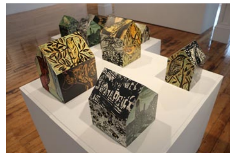
Works by Kent Ambler

The exhibition will be Ambler's largest solo exhibition to date, with his largest-ever three-dimensional component. The show will present three dozen woodcut prints, 20 woodcut-collage house sculptures, and an installation of a shed-sized house structure built from old, carved wood blocks.