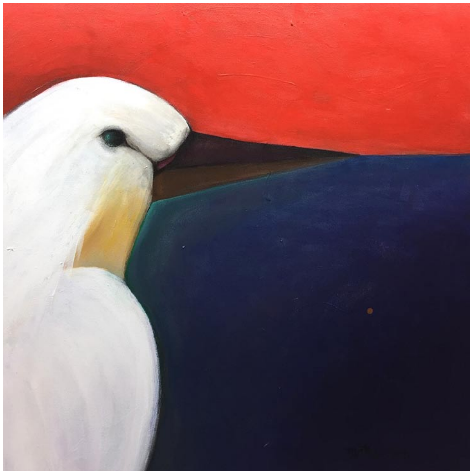
Painting by Catherine Thronton