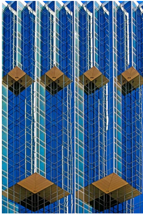
Work by Bruce Weber

NC Institutional Gallery listings, call the Council at 919/643-2500 or visit ( http://www.hillsboroughartscouncil.org/index.html ).