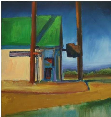
Work by Robert Irwin

Recently, Irwin was granted experimental Parkinson's disease treatment