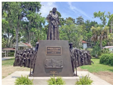
Harriet Tubman Monument, celebrating the Combahee River Raid, by Ed Dwight - Front

The Tabernacle Baptist Church has installed a Harriet Tubman Monument, created by sculptor Ed Dwight, located on the church grounds at 901 Craven Street in Beaufort, SC.