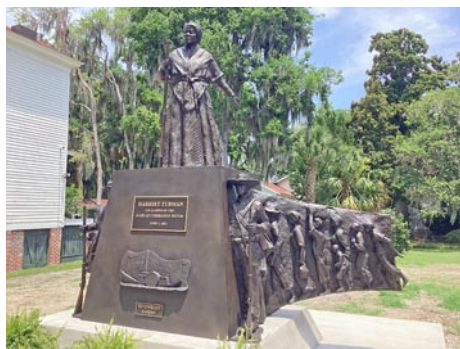
Harriet Tubman Monument, celebrating the Combahee River Raid, by Ed Dwight - Right side

years to raise the funds and three years to complete the sculpture. It was a hard sell because most people never heard the story of Harriet Tubman being in Beaufort. Everywhere we went, we told the story over-and-over again about her presence here and finally historians started to tell the story."