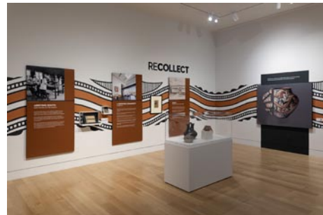
View of "Recollect" exhibition