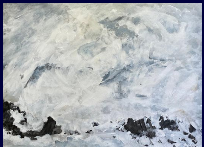
North Atlantic, Iceland , graphite on heavy watercolor paper, 22 x 30 inches

Studio @ East Butler Rd • Mauldin, SC 29662 • 864.320.0973 MelindaHoffmanArt.com