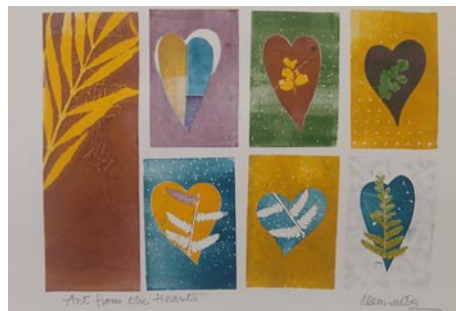
Work by Mona Wu

100 Russell Drive Star, NC 27356 (910) 428-9001