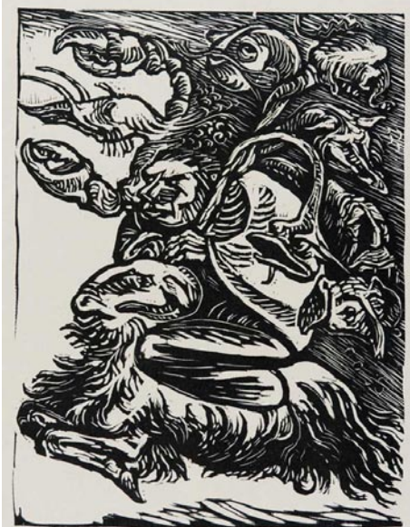
Ernst Barlach, "Riding Urian (the Devil)," 1922-23, from Walpurgisnacht (Walpurgis Night). Woodcut on paper, edition of 120, 11 1/2 x 9 3/8 in. Weatherspoon Art Museum, UNC Greensboro. Museum purchase with funds from the Benefactors Fund, 1976.2362