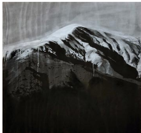
Work by Tom Pazderka

Bella Vista Art Gallery , 14 Lodge St., Historic Biltmore Village, Asheville. Ongoing - Featuring works by regional and national artists in a variety of mediums. Offering contemporary oil paintings, blown glass, pottery, black & white photography, stoneware sculptures, and jewelry. Hours: Mon.-Sat., 10am-6pm & Sun., 10am-4pm. Contact: 828/768-0246 or at ( www.BellaVistaArt.com ).