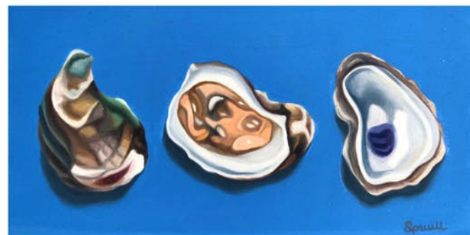
SPRUILL HAYES, THREE DAY WEEKEND I, II, III , 6x12, OIL

THE SANCTUARY AT KIAWAH ISLAND GOLF RESORT 1 SANCTUARY BEACH DR | KIAWAH, SC | 29455 | 843.576.1290 WWW.WELLSGALLERY.COM