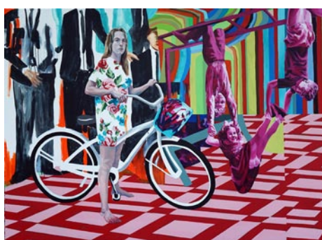
Work by Yvette L. Cummings

According to Cummings, "By making viewers aware of their discomfort, possibly even through similar or shared experiences, the works are intended to stimulate conversation - and, hopefully, inspire change." The figures in her work serve to deconstruct the societal gaze, if you will, that we impose on the female