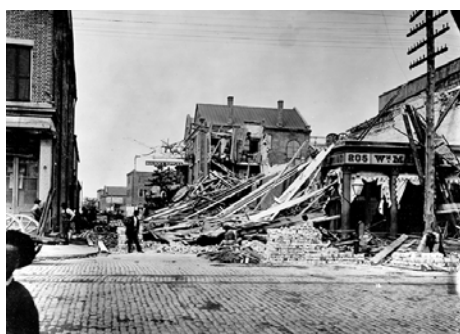
Charleston suffered widespread damage from the 1886 earthquake.

The earthquake triggered many strange afflictions, even in cities far from the epicenter. According to the Savannah Morning News , at least a dozen people went insane and had to be sent to lunatic asylums, including "the wives and daughters of prominent citizens." "A drugstore