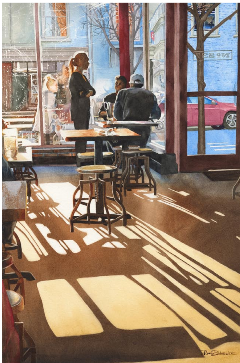
Bonnie Becker Five O'Clock Shadow watercolor 29.5" x 19.5"