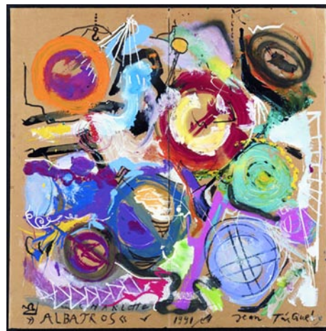
Jean Tinguely, "Albatros" © 2009 Artists Rights Society (ARS), New York / ADAGP, Paris

continued above on next column to the right