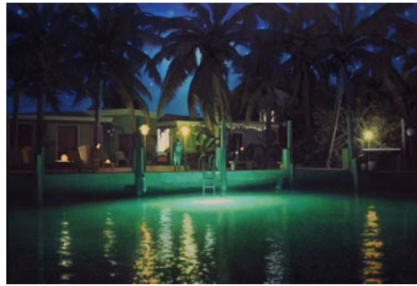
Work by Luke Allsbrook

Our policy at Carolina Arts is to present a press release about an exhibit only once and then go on, but many major exhibits are on view for months. This is our effort to remind you of some of them.