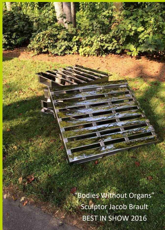
"Bodies Without Organs" Sculptor Jacob Brault BEST IN SHOW 2016