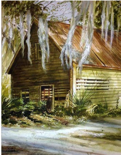
Work by Bill Winn

Sheryl's hand-constructed ceramics are reflective of the forests, shorelines, and towns of the Southeast and our Lowcountry. Her work often fuses natural elements with stoneware, creating dramatic and decorative, yet functional three-dimensional