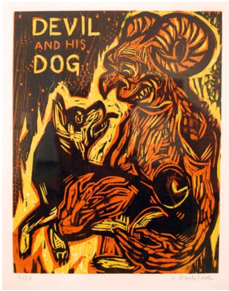
Work by Kent Ambler

For further information check our SC Institutional Gallery listings, call the Museum at 864/582-7616 or visit ( www.spartanburgartmuseum.org ).