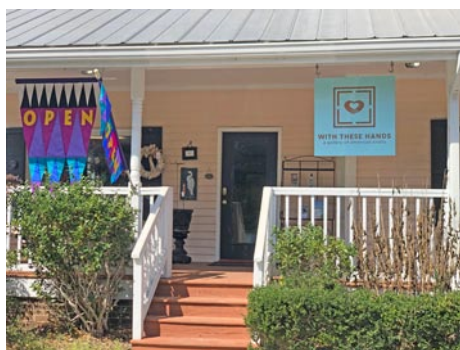
A view of With These Hands Gallery