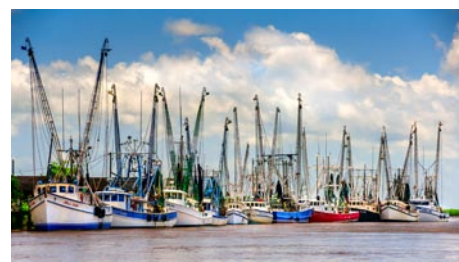
Work by Linda O'Rourke

The theme is Field Trip , showcasing images of natural and historic sites throughout the region. A highlight of the exhibit will be photographs by student winners of the