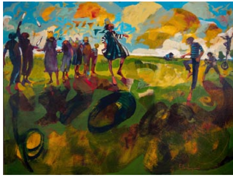
Work by Ellen Langford

For further information check our NC Commercial Gallery listings, call the gallery at 828/281-2134 or visit ( www.amerifolk.com ).