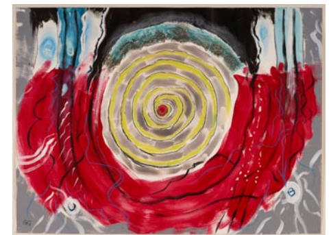
Work by Ginger Graziano

Graziano offered the following statement, “My art invites mystery to emerge. I