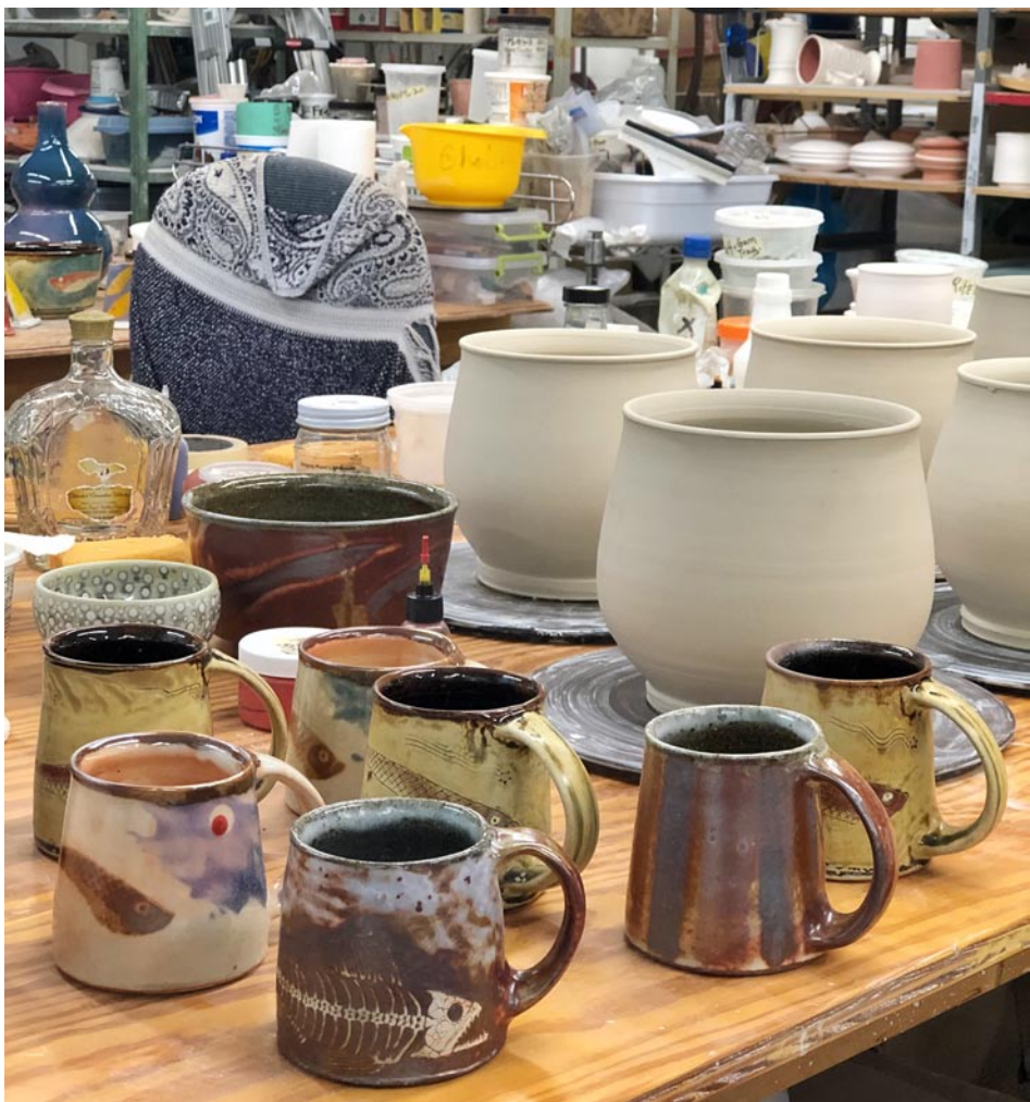
Porcelain bowls drying before trimming out the bottom to create the foot, and assorted finished mugs and bowls being evaluated from the recent firing before going to the pottery shop. Shino is a creamy to peach colored base glaze with atmospheric effects and good color response like the mug on the left with the lavender and blue patch with a red spot near the handle.