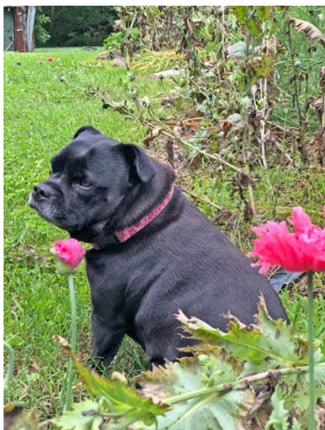
Luna Bella, Bulldog Pottery's official mascot, likes to greet the customers and hangout in the Bulldog Pottery garden.