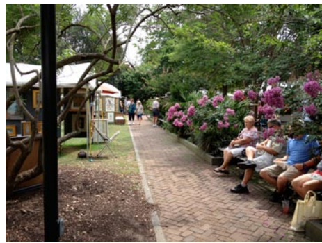
Piccolo Spoleto Outdoor Art Exhibition at Marion Square Park

Circular Congregational Church , Upper Lance Hall, 150 Meeting Street, Charleston. Through June 9 - "Art of Recovery 2019 Exhibit," featuring an award-winning exhibit of over 100 original works that takes the viewer on a journey through the challenges and triumphs of the human experience. A Piccolo Spoleto Festival event. Hours: daily 11am-7pm. Contact: Call the Office of Cultural Affairs at 843/724-7305 or visit ( www.piccolospoleto.com ).