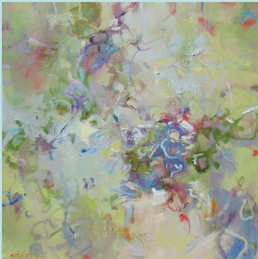
Don't Feed the Alligators!

original oil mixed media on canvas, 24" x 24" $2250 for more info contact Hagan Fine Art at 843.901.8124