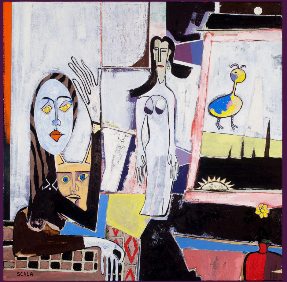
"Madam, There's Someone at the Window," oil on linen, 36 x 36 inches