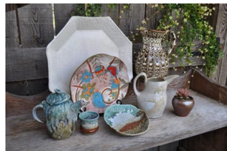
Works from Potteries participating in Tea with Seagrove

Take a journey through Seagrove June 13, 2015, to have Tea with Seagrove Potters. It's the perfect time of year for a garden tea party with Blue Hen Pottery, Dean & Martin Pottery, Eck McCanless Pottery, Pottery Road Studio and Thomas Pottery.