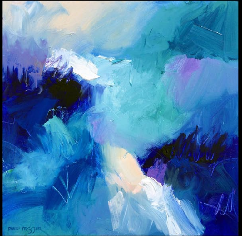
Lafayette Bleu, 30x30 Acrylic on Canvas