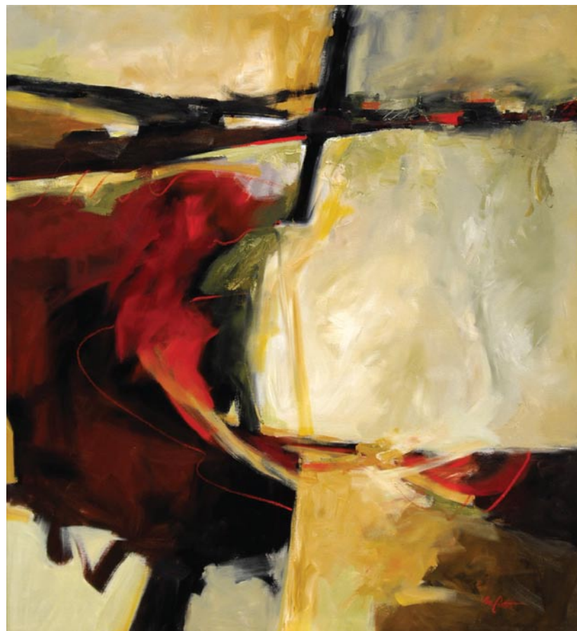
Intention Oil on Canvas, 72 x 66 inches

continued above on next column to the right