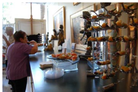
Tastings from BLU at Ella Richardson Fine Art from last year's event.

The event is presented as part of the Charleston Fine Art Dealers' Association's Studio Series, benefiting visual arts programs at the Gibbes Museum of Art, Redux Contemporary Art Center and the College of Charleston School of the Arts. Cost is $45 per person. Tickets can be purchased at ( www.cfada.com ).