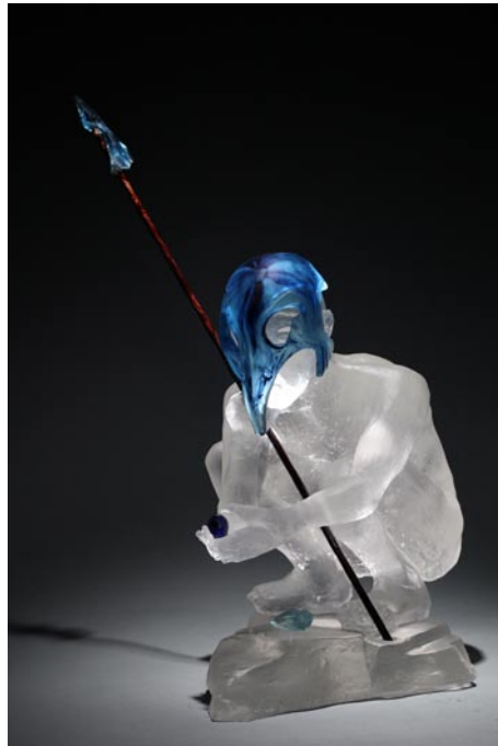
Stephen Pon, Water Boy , Pate de Verre, Kiln Cast, Hot-worked, Carved Glass, 19" h x 13" w x 13" d

team) completes all aspects of the creation of a piece, from design through signature. Most studio glass artists will make fewer pieces in their lifetimes than factories like Baccarat or Waterford will make in one day.