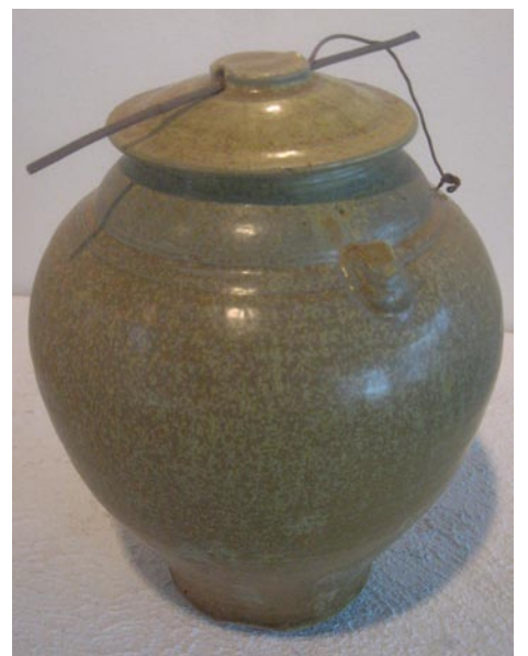
Work by Jo Jeffers

fascinated by the color and texture of wood. I have always sought graceful forms and fine detail with my work on the lathe," says Hugh, adding, "After years of exploring the bowl form, I am making more hollow vessels and sculptural pieces. Recently I have begun adding textures, carving and some colors to the finished surfaces. Pleasing shapes are always my priority. Woodpiles, tree service lots and storm-felled trees are sources for most of my material."