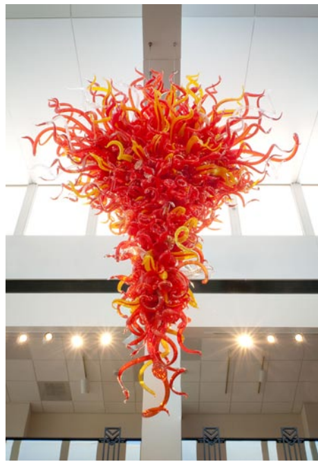
Dale Chihuly glass chandelier