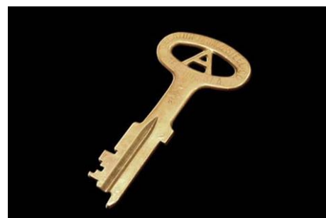
Key to Martin Luther King Jr.'s jail cell in Birmingham, AL, where he composed his famous "Letter From the Birmingham Jail."

Covering more than 10,000 square feet at the Center, the exhibition will present a historical continuum of pivotal moments