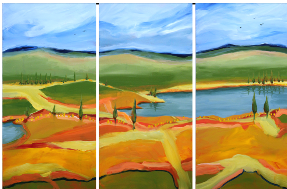
French Countryside • triptych, acrylic on canvas • each panel: 36" x 18"

continued above on next column to the right