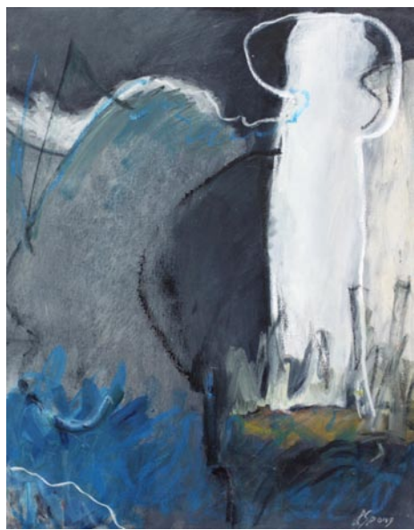
Work by Laura Spong

Spong is among South Carolina's best non-objective painters. Except for a few urban landscape scenes, still lifes and figurative paintings, mostly done as art-class assignments in the 1950s, Spong has always produced non-representational,