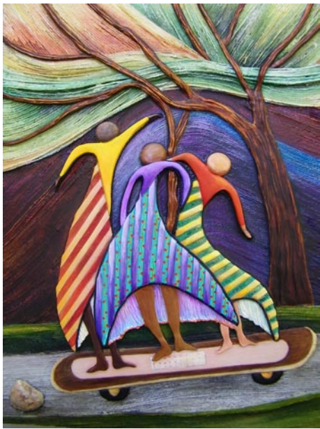
Work by Beth Regula

Throughout downtown Spartanburg's Cultural District, Ongoing - The Creative Crosswalk Project is a public art initiative in which local artists and designers design and paint a series of crosswalk murals, transforming the crosswalks into works of art, on Main Street in Spartanburg, SC. The downtown cultural district area is often bustling with events and pedestrians, and the pedestrians rely heavily on a multitude of crosswalks to safely traverse the downtown Spartanburg area. The problem is that crosswalks are incredibly easy to overlook, they are rarely visually appealing, and they can even be quite dangerous. In an effort to remedy these issues, Chapman Cultural Center, the City of Spartanburg, and the Spartanburg Area Chamber of Commerce came together to organize the Creative Crosswalk Project. For more info visit ( https://www.chapmanculturalcenter.org/pages/blog/detail/article/c0/a1555/ ).