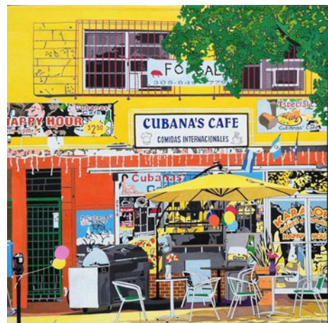
Work by Keiko Genka

For further information check our NC Institutional Gallery listings or visit ( www.caldwellarts.com ).