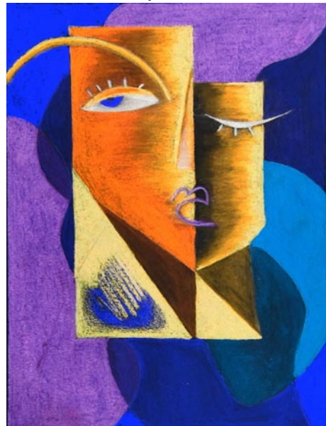
Work by Natalie Klimovich

Please visit the Facebook link to view the exhibition: USC Upstate Gallery Art at ( https://www.facebook.com/USCUpstate-GalleryArt/ ) and student videos on YouTube at ( https://www.youtube.com/channel/UCDK9-NTesUiWyG8IX02tR3w ).