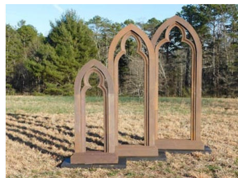
Sculpture by Beau Lyday

Visual art offerings unique to this year's festival include Honduras: Nuestro Arte, Nuestra Vida , an international group exhibition featuring painters from